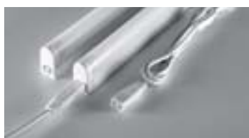
T5 tube (14W + 28W) + IL002-003 T5 tube 14W - 59 cm T5 tube 28W - 119 cm IL002-003 - 180 cm